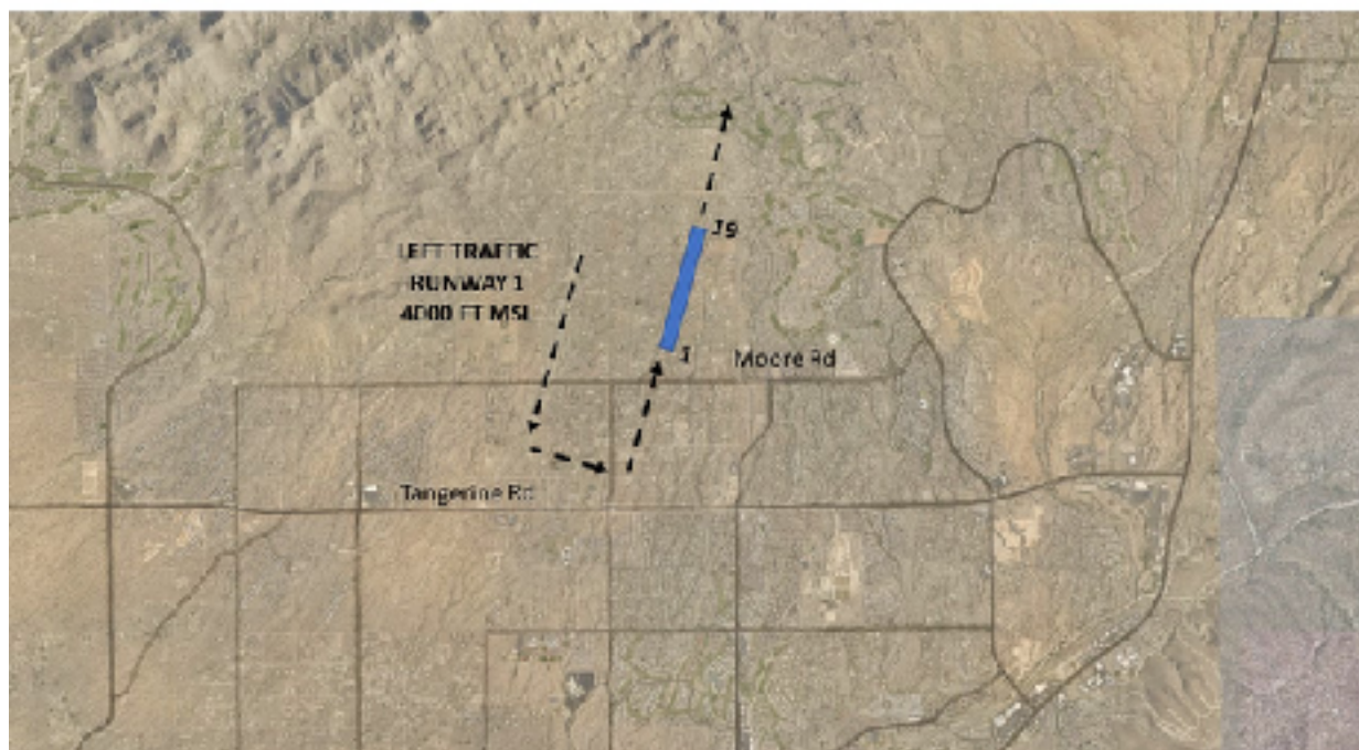
RUNWAY 01 TRAFFIC PATTERN