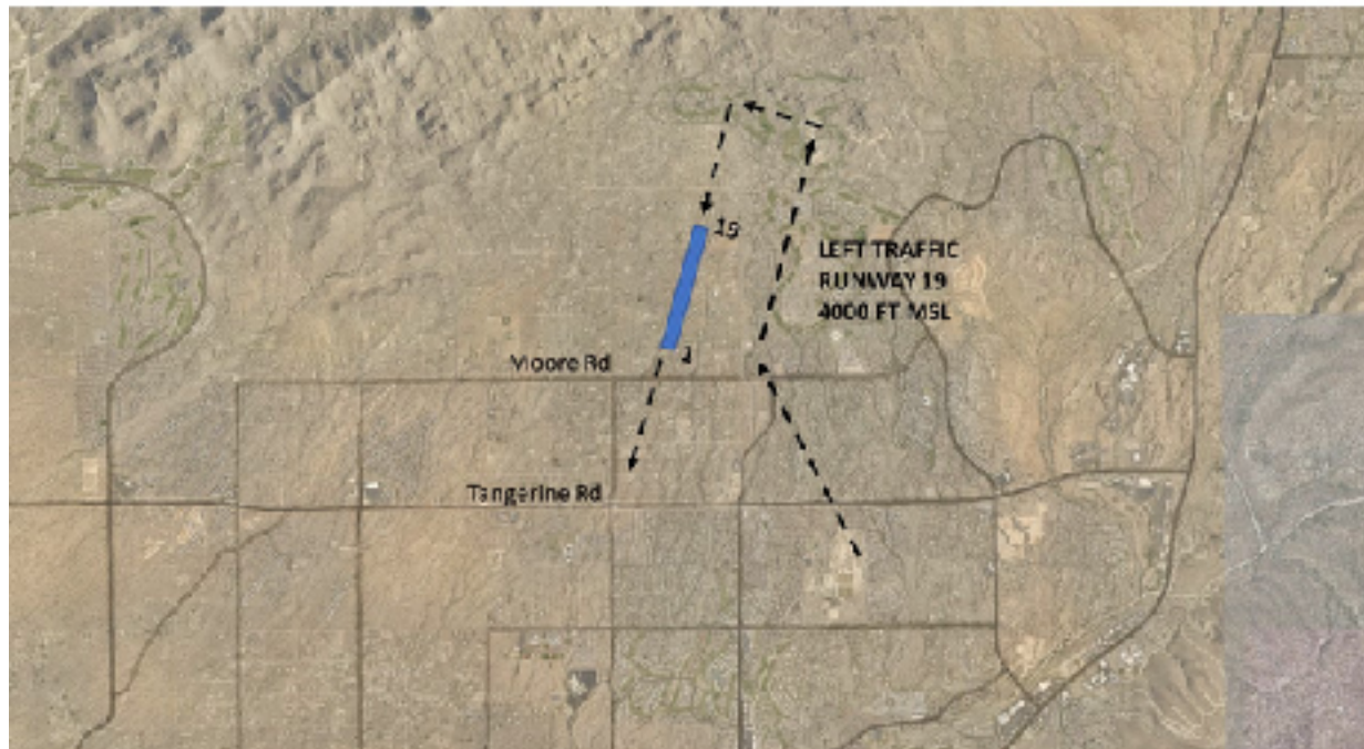
RUNWAY 19 TRAFFIC PATTERN